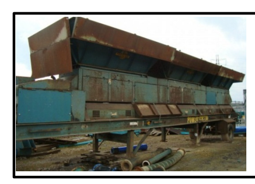
3 Bin Blender