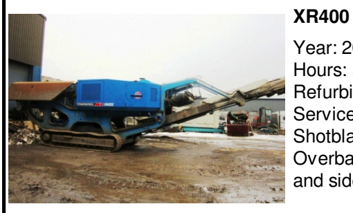
Year: 2007 Hours: 5300 Refurbished & Serviced Shotblasted & painted Overband magnet and side conveyor