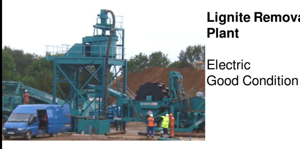
Lignite Removal Plant Electric