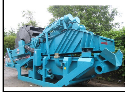
Powerscreen Finesmaster 120 Twin Sand Plant

Electric Fully refurbished w/ control panel